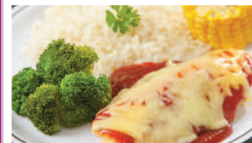
BBQ Chicken served with Savoury Rice and Seasonal Vegetables