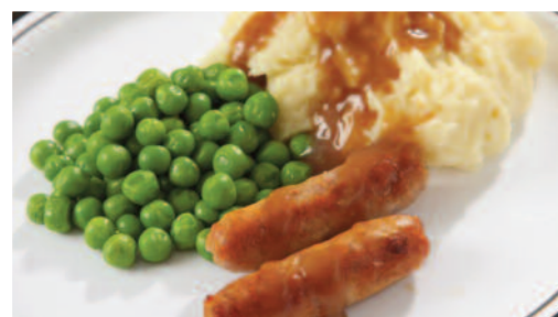
Sausages served with Mashed Potato, Seasonal Vegetables & Gravy