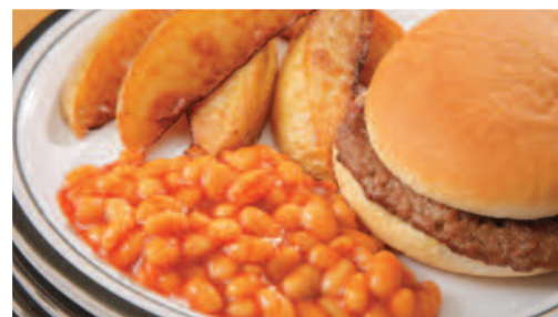
Beef Burger served in a Bun with Potato Wedges & Seasonal Vegetables or Baked Beans