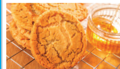
Golden Crunch Cookie

AVAILABLE EVERY DAY – UNLIMITED SALAD, FRESHLY BAKED BREAD, FRUIT YOGHURT & FRESH FRUIT PLATTER. FOR ALLERGEN INFORMATION, PLEASE ASK ONE OF OUR CATERING TEAM. ALL THE ABOVE DISHES ARE SUBJECT TO AVAILABILITY.