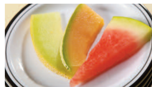
Trio of Melon