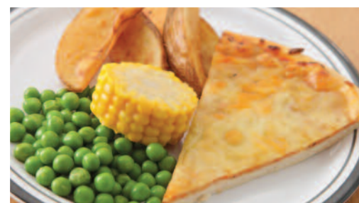
Cheese & Tomato Pizza, served with Potato Wedges & Seasonal Vegetables