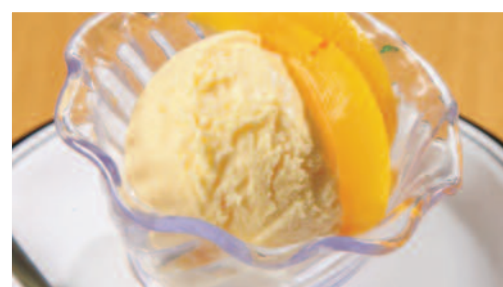
Ice Cream & Fruit