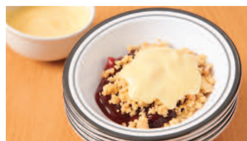
Fruit Crumble & Custard