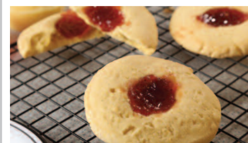
Jam & Custard Biscuit