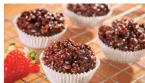
Chocolate Crispy Cake