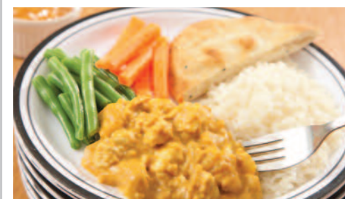
Chicken Korma served with Rice, Naan Bread & Seasonal Vegetables