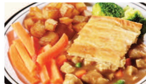
Homemade Chicken Pie served with Diced Crispy Potatoes & Seasonal Vegetables