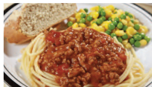
Spaghetti Bolognese served with Garlic & Herb Bread and Seasonal Vegetables