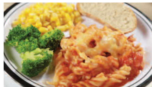
Cheese & Tomato Pasta served with Garlic & Herb Bread and Seasonal Vegetables