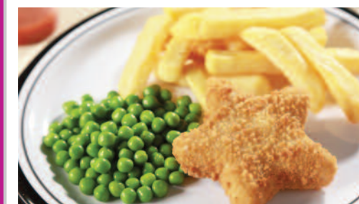
Fish Star (MSC) served with Chips & Peas or Baked Beans