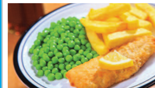
Battered Fish (MSC) served with Chips & Peas or Baked Beans