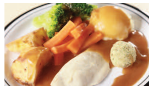
Roast Chicken served with Roast/Mashed Potatoes, Seasonal Vegetables & Gravy