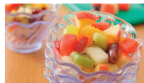
Fresh Fruit Salad