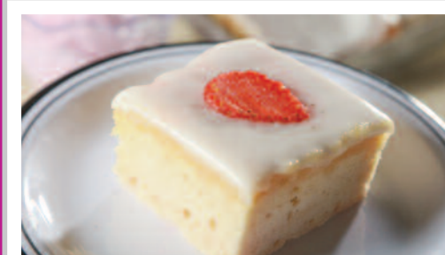
Strawberry Ice Cream Cake