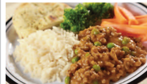
Beef Keema served with Rice, Naan Bread & Seasonal Vegetables