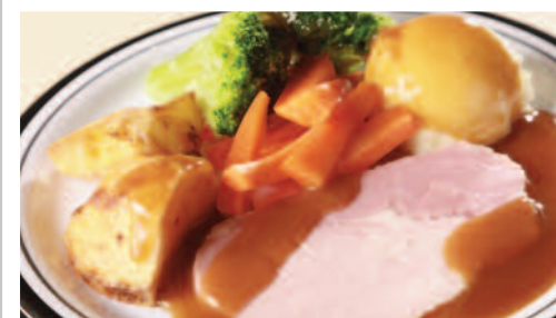
Honey Roast Gammon served with Roast/Mashed Potatoes, Seasonal Vegetables & Gravy